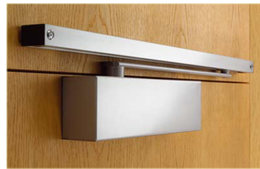
picture shown door closer is mounted with sliding guide rail included with metal cover